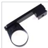
Adapter set (LED-3 / LED-5 only for DB/DB JR/E1)